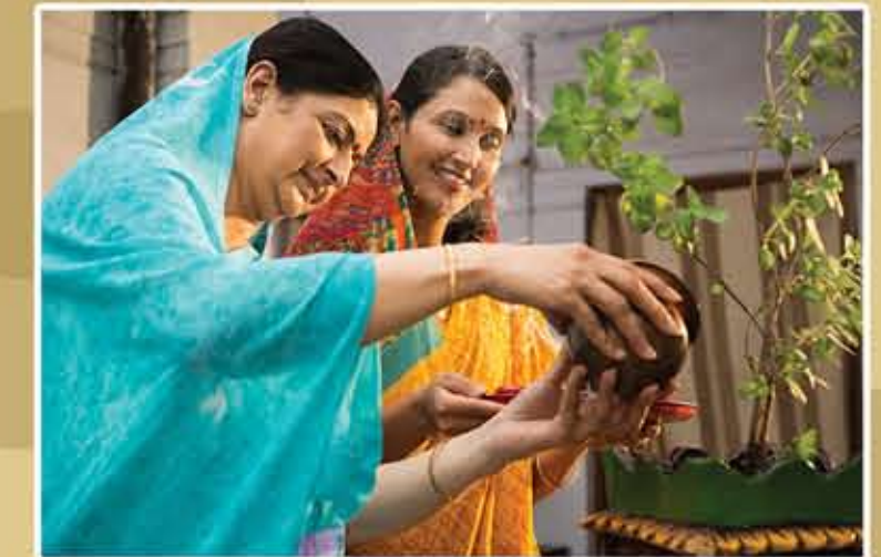
The next dimension of vill life

Which is why choosing the right home is important. It has been specially conceived for people who want more from life and their homes for that rare breed of dreamers and achievers for whom good is not good enough.